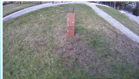
Prince Gallitzin State Park Beaver Valley Marina Snowmobile Trail