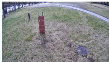
Prince Gallitzin State Park Beaver Valley Marina Snowmobile Parking Lot