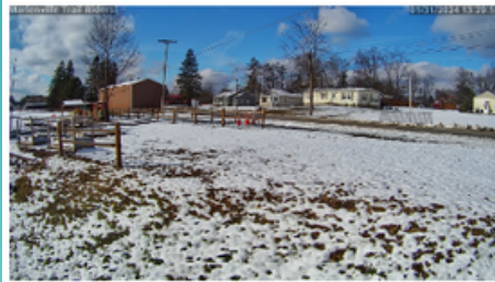
Marienville Trail Riders Snowmobile Club