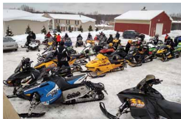
One of the stops on our Poker Run.