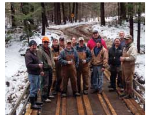
The work crew making final modification to one section of our trail.