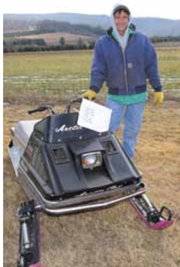
Al Clark - '72 Puma