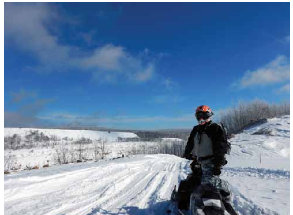
Scott at the new view of the turnpike crossing on the south side.