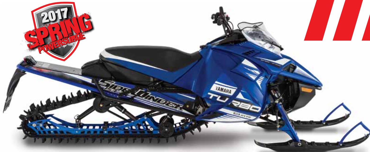
Sidewinder B-TX LE features Genesis Turbo engine!